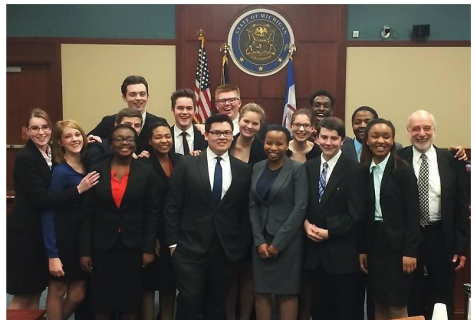
Kalamazoo Central High School's varsity mock trial team won the state championship Saturday, March 19, in Lansing.

This year's case is criminal case, People v. Casey Campbell . We extend our sincere thanks to the Constitutional Rights Foundation and Classroom Law Project for granting us permission to adapt this case for use in our competition.