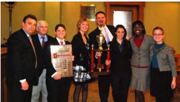
2010 Ohio State Champs from Indian Hills HS