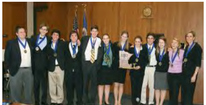
2010 Minnesota State Champs from the Breck School