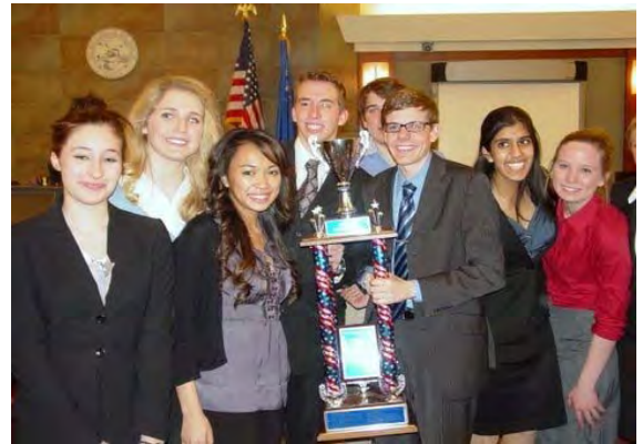
2010 Nevada State Champs from Bishop Gorman HS