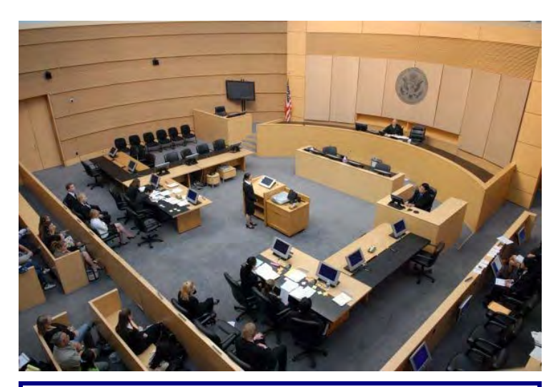
The Special Proceedings Courtroom in the United States District Courthouse will be the venue for the 2011 National Championship Round.

The Superior Court will be open to the public on Friday, and full security will be in effect on both Friday and Saturday. Everyone will have to remove their belts and pass through a metal detector, and all belongings will have to be scanned. We are working with the Superior Court to make this process go as smoothly and quickly as possible, and we ask for everyone's cooperation with this process. More information regarding courthouse security is available in the Handbook, and additional information will be provided as we get closer to the Championship.