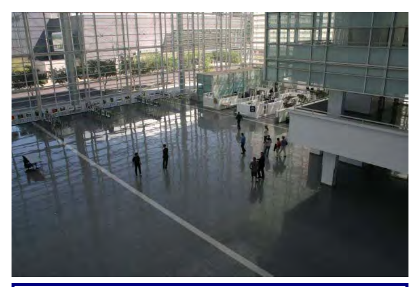
The Awards Banquet will be hosted in the atrium lobby of the U.S. District Courthouse on Saturday, May 7th.

The deadline for volunteer judges to purchase banquet tickets is April 22, 2011. The 2011 National Championship will close with a dance for the students on Saturday night. The dance will be held at the Hyatt Regency Hotel immediately following the awards banquet.